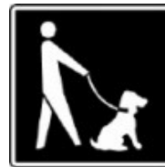
Dogs on Leash